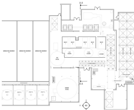
General Arrangement Existing Ground level_1 : 200